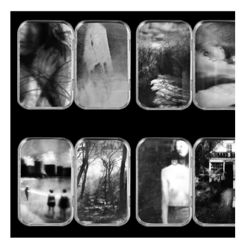
CLOCKWISE FROM TOP LEFT: Volume II. #4: The Wind and the Sky, Volume I. #3: The Snow and the Watcher, Volume II. #3: The Sea and the Forest, Volume II. #2: The Girl and the Hotel